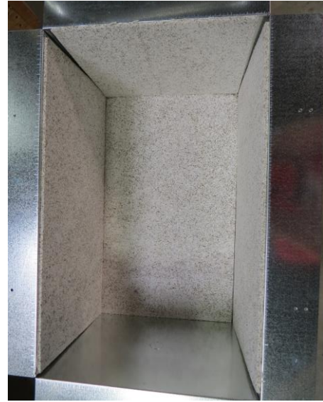
Recessed Light Enclosure Intumescent lined, Model #ezb 16-24-9I

Architects, specifiers and installers can easily maintain the integrity of the fire-rated ceilings for two-hours by using the e.z. barrier enclosure and 3M Intumescent material. Both materials are fire-rated for one-hour each, combined for a two-hour enclosure.